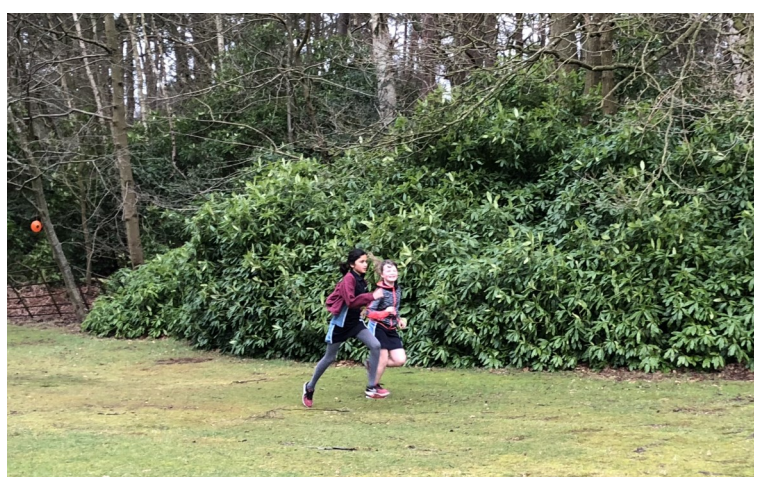
Congratulations to all of those involved!