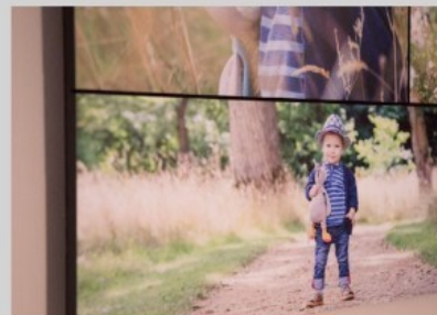
4 IMAGE MOSAIC (TOTAL SIZE 24"X24") - £695