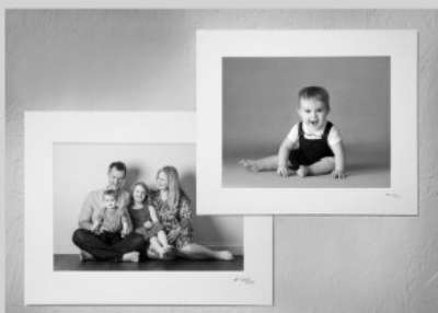
A COUPLE OF A4 FINE ART MATTED PRINTS - £150 EACH