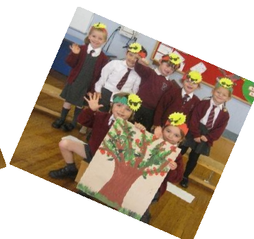
This week's class assembly 'Seasons and Time' was performed by Owl Class