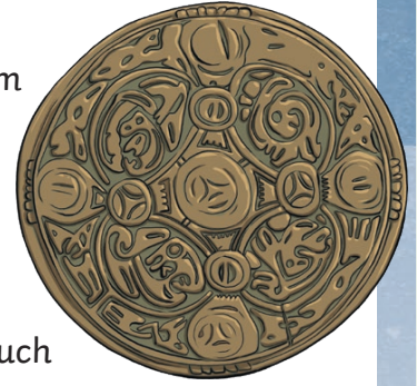
A small Viking brooch made from bronze

Viking jewellery was made from precious metals, such as gold and silver, and even animal bones. Vikings wore rings, brooches, bracelets and necklaces and many featured animal designs.